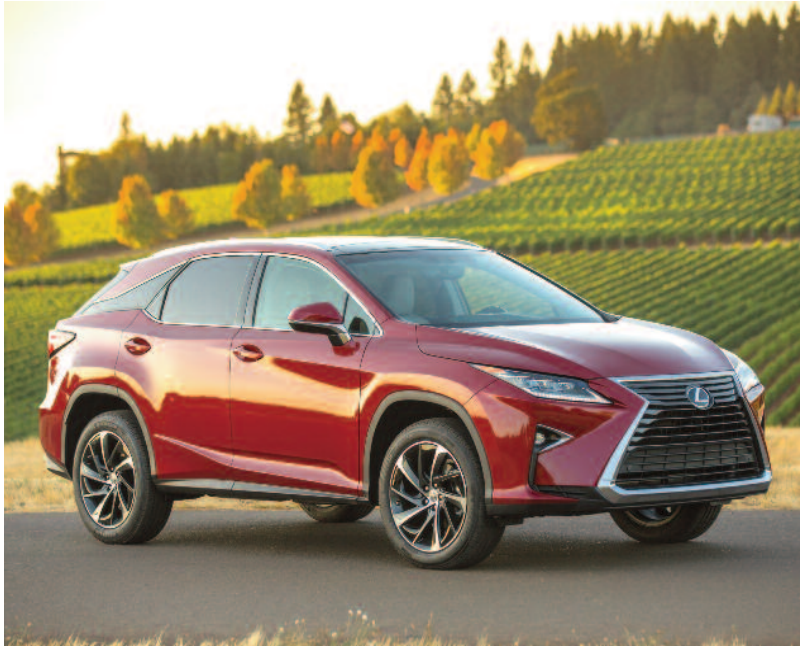
2016 Lexus RX 350

Who wouldn't love this sexy and sophisticated 5-door SUV? With its elegant good looks combined with all the comfort we should expect from a luxury vehicle, the RX-350 shines with star power.